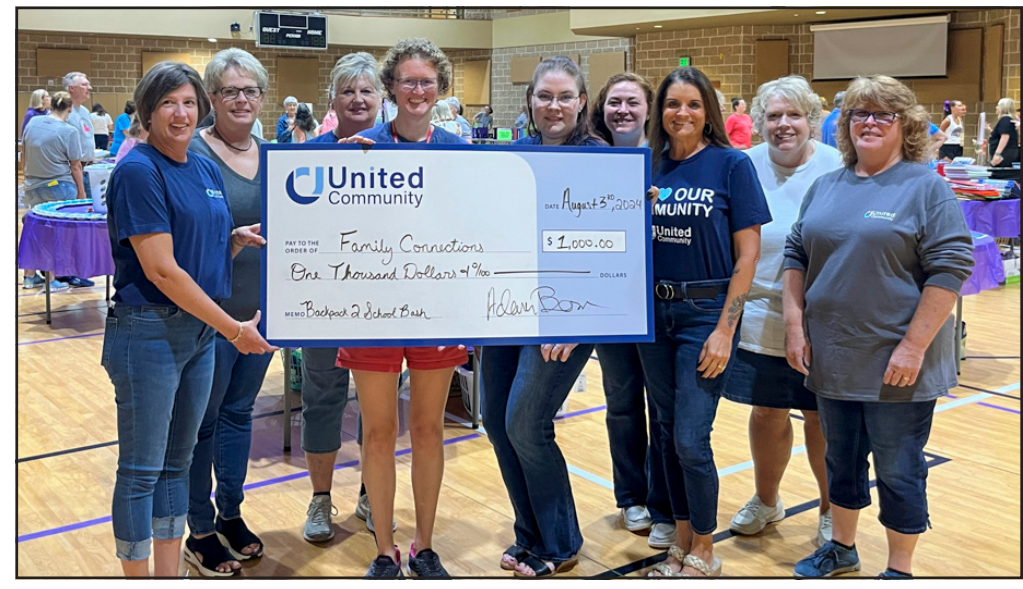
United Community presenting Family Connection a check representing funds its customers helped raise for this year's Backpack 2 School Bash at First United Methodist Church.

More than 530 school staff also enjoyed the annual back to school picnic thrown for them by United Community, which has been going strong for more than a decade. The bank provides a