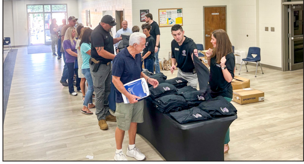
United Community was thrilled to be able to give back to Union County Schools once again during this year's United Community Teachers Picnic to kickstart the new school year.

United Community would like to extend a heartfelt "thank you" to all the bank patrons and members of the community who helped make the 2024 year of giving such a huge success for teachers and students.